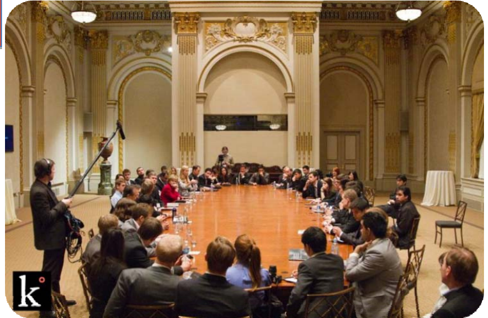
Round table discussion at Kairos Global Summit 2011, New York Stock Exchange

Our largest event held each February in New York City to bring Kairos leading entrepreneur fellows alongside global leaders together in creating innovative businesses, in partnership with the New York Stock Exchange and United Nations , etc.