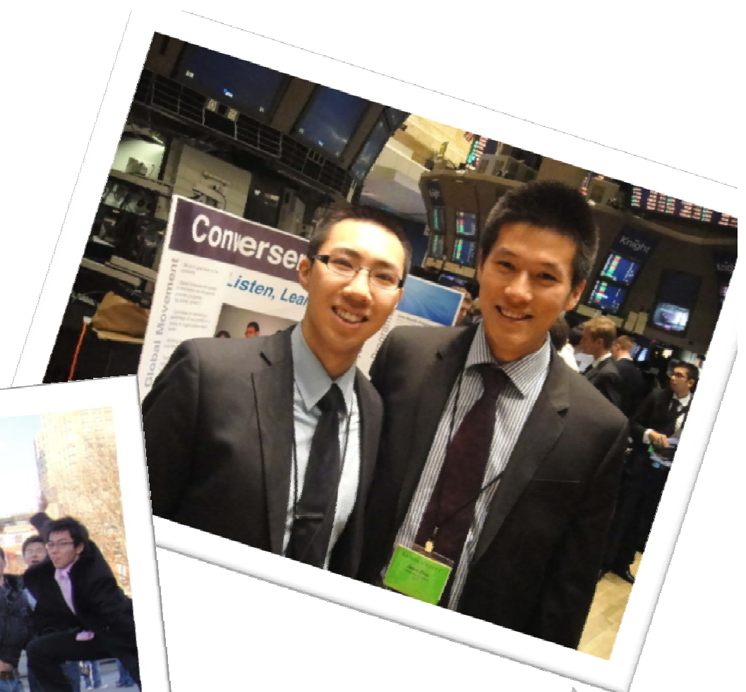
Chinese student entrepreneurs showcase their business at NYSE, 2011