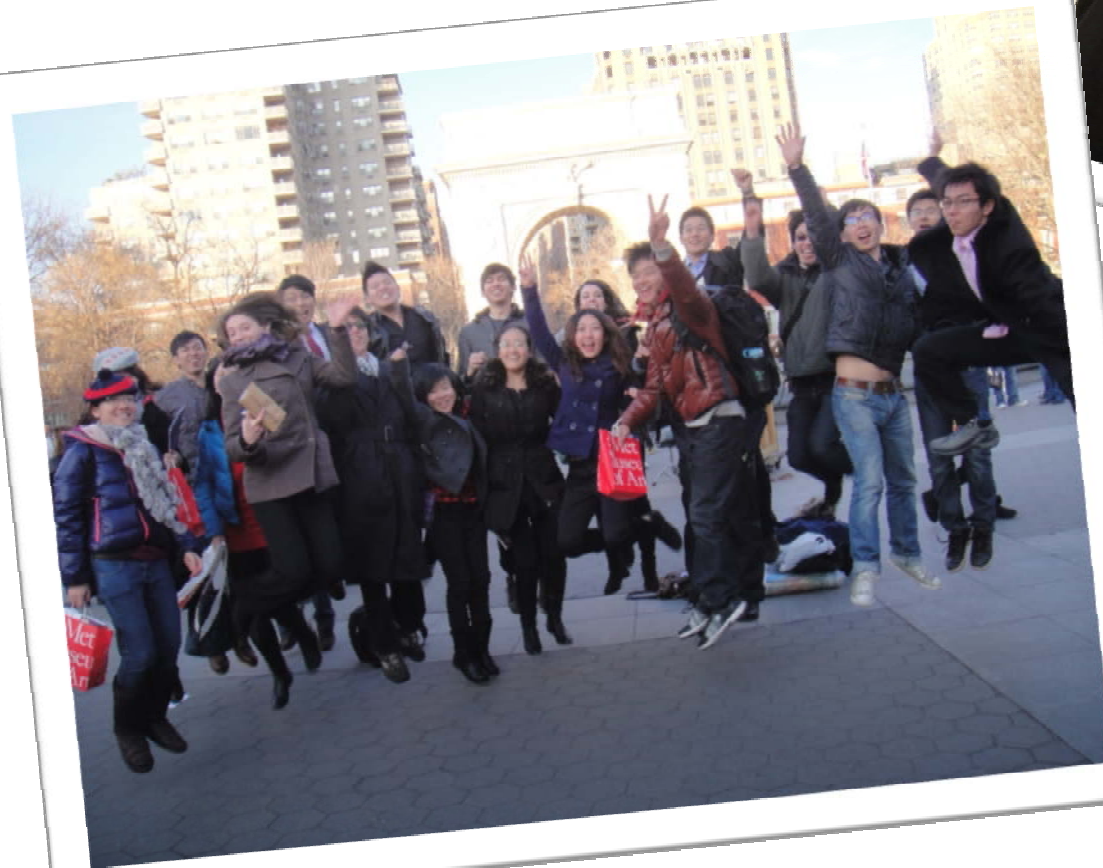
Chinese fellows at New York for Kairos Global Summit, 2011